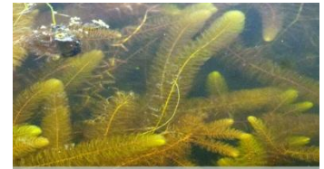
Variable leaf milfoil

2. Early Detection - Plant Surveys – Specially trained staff members and volunteers identify and document locations and levels of invasive plant infestations in our waters. This data is then used to create a